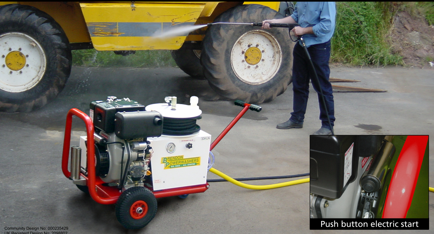
Push button electric start

Community Design No: 000235429 UK Registered Design No: 2098802